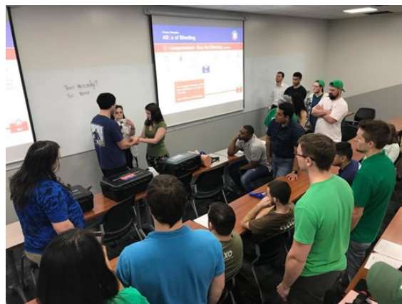
Stop the Bleed Training with EADP 4010 students

The Spring Public Health and Disasters course successfully exposed students to a variety of disasters that impact public health, hospitals, as well as the long term general wellbeing of the community. Emergency Support Function 8 (ESF-8) Public Health and Medical Services, a key sector in the National Response Framework, is often activated in response to emergencies or disasters locally, within the State of Texas, and nationally. Our class discussed some of these activations as we looked at Hurricane Harvey and the evacuation of hospitals. We also considered long term health effects of drinking water pollution in Flint, Michigan. Student were asked to listen to podcasts and discuss in class flu pandemics and the Ebola outbreak. EADP 4010 also taught students the basics of Stop the Bleed, Texas Disaster Medical System and the Emergency Medical Task Force. In addition to the aforementioned Stop the Bleed instructor we had three guest speakers present this year from Denton County Public Health, UT Southwestern, and Tarrant County MHMR. Attendance for the class was at near max capacity (48 out of 50 seats) and included a wide array of experience and backgrounds. While some students possessed a clinical background, those interested in the taking the course will be comforted to know that most students do not have a medical background.