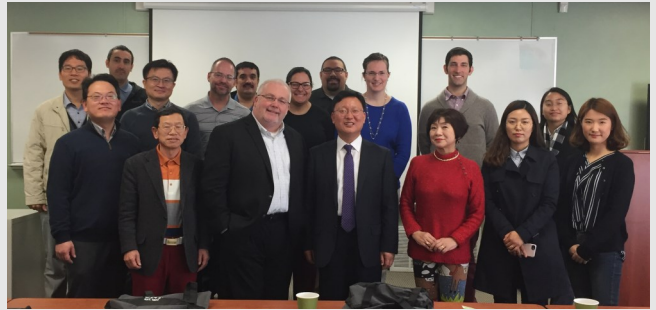
Left: EADP Class of 2022 screen the film San Andreas and discuss disaster myths with EMDS faculty as part of HPS' First Flight activities. Above: EMDS welcomes distinguished guests from Chungbuk National University in South Korea. Below: EMDS hosts the FEMA Region 6 Higher Education Collaborative Workshop.